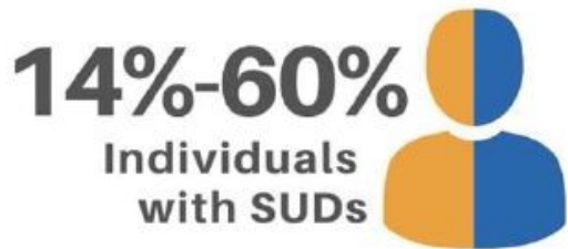
Substance Use Disorders